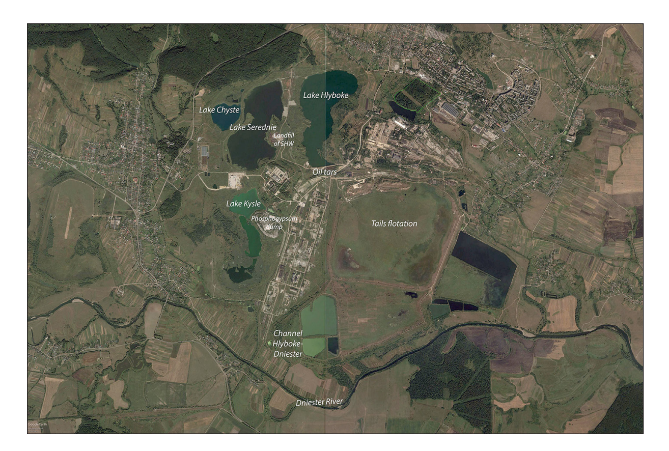
Fig. 1. Location of industrial waste on the territory of State Enterprise "Rozdil Mining and Chemical Enterprise "Sirka"

Soil sampling, selected in 2017, is analyzed using X-Ray Diffraction (XRD) technique. The concentration of elements in the sample was